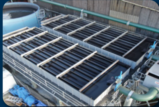
Lamella Clarifier – Steel Manufacturing Queensland