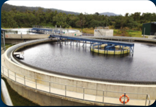
Clarifier – Municipal STP Queensland