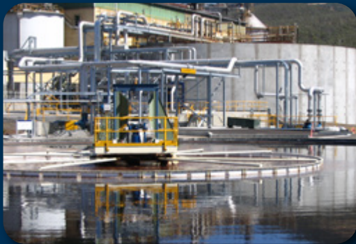
Clarifier – Pulp and Paper Tasmania