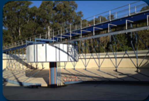
Clarifier – Municipal WWTP New South Wales