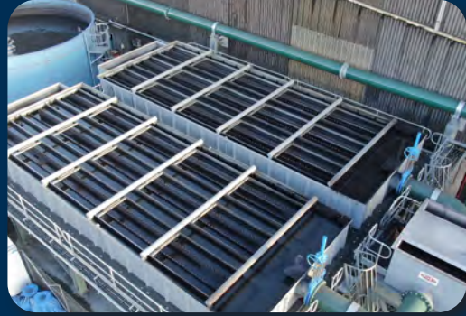
Lamella Clarifier — Steel manufacturing