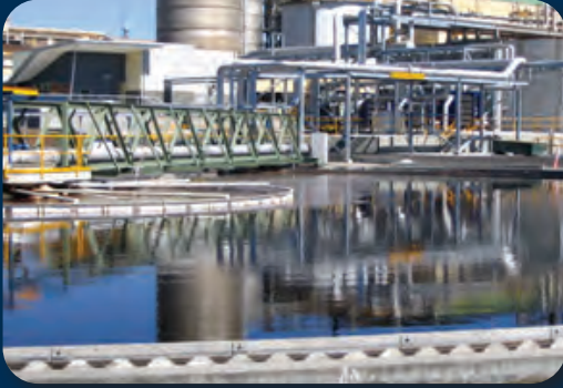
Clarifier — Pulp and paper