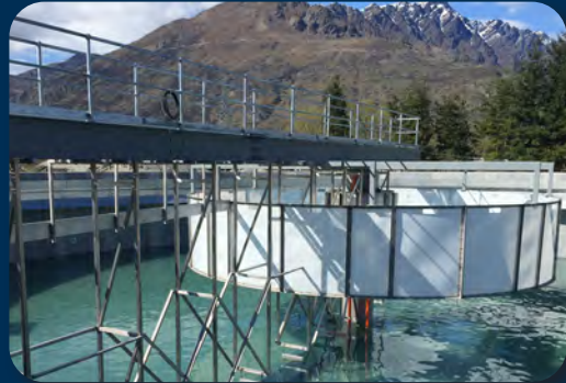
Clarifier — Municipal WWTP