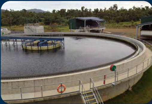
Clarifier — Municipal WWTP