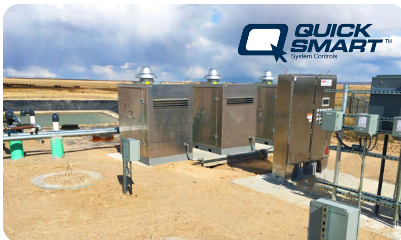
Advanced automation options are available with S&L's QUICKSMART ™ Touchscreen Controls.

S&L Modular FAST ® smart technology options meet your specific needs.