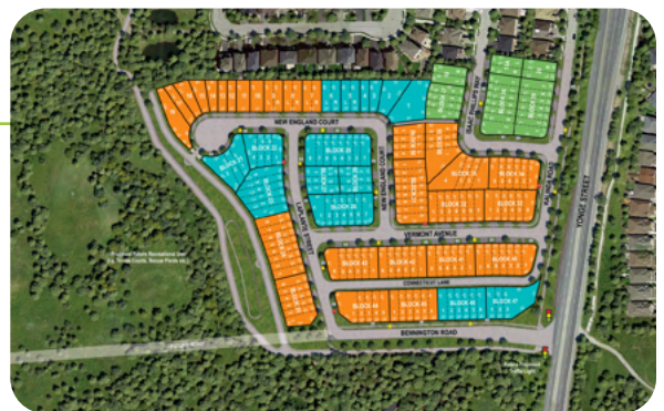
Phased installation offers planning benefits

design makes it ideal for variable flows and on-site applications. Modules can be easily added for increased capacity or phased growth requirements. Meets environmental and aesthetical concerns by locating sub-surface, out of sight and out of mind with integral odor control features and options.