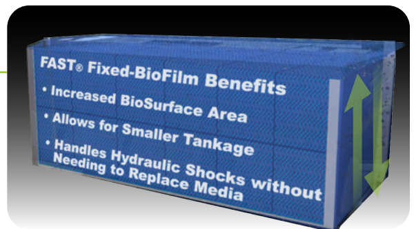
S&L FAST® Media significantly reduces tank sizing while protecting against shock loads.

because its stable biofilm process yields a much longer sludge age [SRT] than typical biological systems, enabling it to withstand hydraulic shock loads and prevent bacterial washouts — all in a smaller footprint. Best of all, no daily operator attention is required because of the self-regulating process of the attached growth. Operation and maintenance is simple.