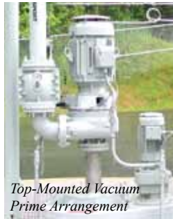
Top-Mounted Vacuum Prime Arrangement

PISTA® TURBO™ Grit Pumps can be remote-mounted flooded suction or top-mounted vacuum-primed (with SONIC START® STREAMLINE™ prime sensing, photo at right). Top-mounted units eliminate expensive piping while lowering the head and horsepower requirements — and thereby lowering operational costs.