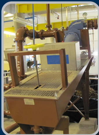
Grit Classifier with single Cyclone

Fine Grit Removal and Dewatering for a complete range of grit removal applications