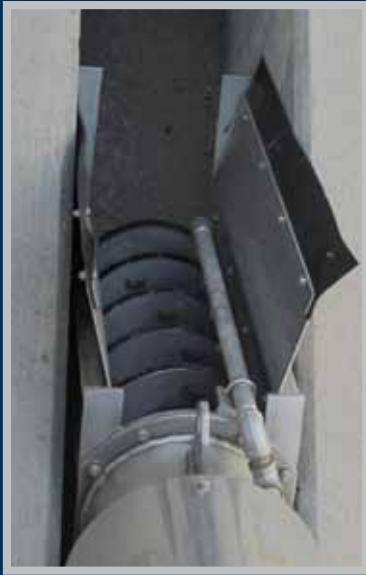
Mark XV-A™ shown in-channel

Fine Screening for Small to Medium Flows with perforated or wedge wire composition. Complete options for compacting / washing