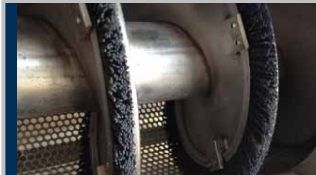
Pictured at left: The S&L SCHLOSS™ Mark XV-A™ perforated screen basket design is efficiently cleaned by the outer spiral brushes connected to the screw.

Online: SmithandLoveless.com Phone: 913-888-5201 FAX: 913-888-2173