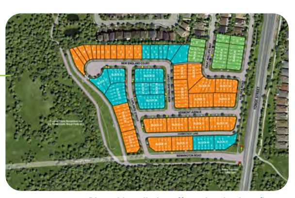
Phased installation offers planning benefits

design makes it ideal for variable flows and on-site applications. Modules can be easily added for increased capacity or phased growth requirements. Meets environmental and aesthetical concerns by locating sub-surface.