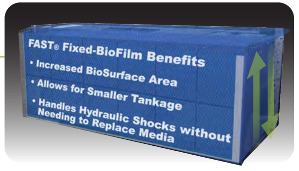
S&L FAST® Media significantly reduces tank sizing while protecting against shock loads.

because its stable biofilm process yields a much longer sludge age [SRT] than typical biological systems, enabling it to withstand hydraulic shock loads and prevent bacterial washouts — all in a smaller footprint. Best of all, no daily operator attention is required because of the self-regulating process of the attached growth. Operation and maintenance is simple.